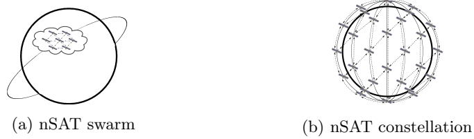
Fig. 1.1: Logical representations of common nSAT topologies.

after the other. In a constellation , nSATs are equally spaced in the chosen orbital plane (or planes in case of multi-orbit constellations) [14]. Their deployment is sequential and highly synchronized. In both cases, the use of a set of nSATs leads to some advantages: for instance, in [15] the data gathering, processing and transmission functions towards Ground Stations (GSs) are distributed throughout the whole swarm. The limited resources can be better exploited by sharing the computing power and employing data exchange through Inter-Satellite Links (ISLs). Communication latency decreases thanks to the higher amount of contacts between GSs and nSATs, especially in constellations where these contacts are spread during all the day, which also leads to a considerable improvement in throughput. The employment of more than one nSAT allows achieving a larger footprint (area on the Earth's surface covered by nSATs) and providing a higher fault tolerance. Nowadays, there are hundreds of on-going projects which involve nSATs. Thousands of these objects are in orbit and still active, as reported in the online Nanosatellite Database at www.nanosats.eu . The most relevant features of possible nSAT network configurations under consideration in this work, i.e., single, swarm, and constellation, are summarized in Table 1.1.