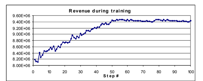
Figure 1. Simulation scenario I, revenue during training.